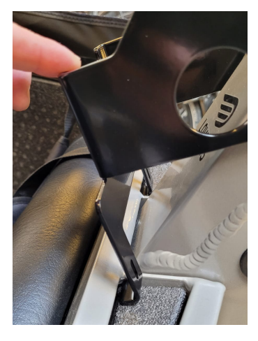
2.2 Tilt the lock vertically and now press the battery lock down along the top tube with considerable force. The foam will be pressed in slightly, but it will bounce back later. To prevent damage to the top tube, you can also use 2 plastic cards in the places between the top tube and the 2 hooks to guide the battery lock in the downward movement.