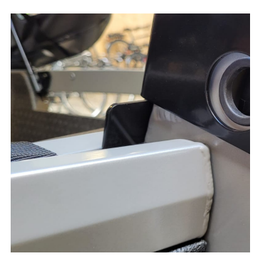
Step 3. Assemble the Lockride Defender.