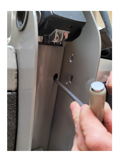
1.1 Remove the battery from the bicycle and slightly loosen the 2 Allen screws under the battery (maximum 3 rotations).