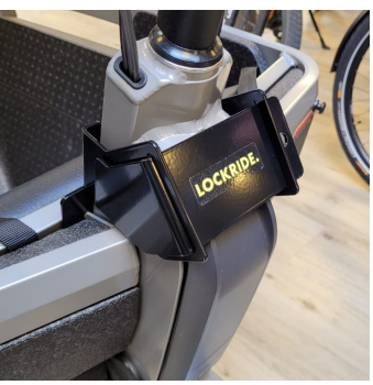
3.3 Mount the slide in the bracket and attach the Abus Diskus lock.