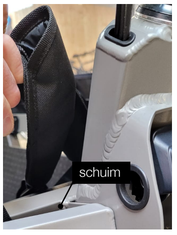
1.2 Lift the top tube as far as possible to create space between the foam and the top tube.