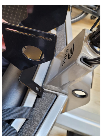
2.1 Place the Lockride with the two small hooks between the foam and the top tube.