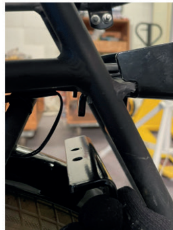
2.3 The Lockride can now be fixed using the L bar. Make sure the closest distance holes are placed upwards.