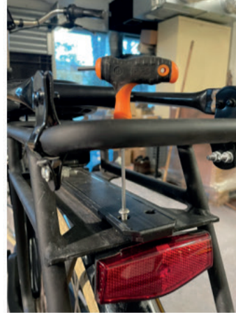
1.3 Remove the original screws from the battery docking.