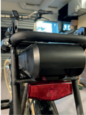
1.1 Unlock the battery.