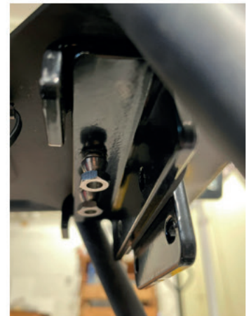
2.4 Use the spring washer and shear nut to fix the L profile lightly. Don't fully tighten the nuts and make sure to place them in the correct order as in the picture.