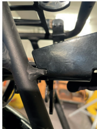
2.2 Push the Lockride against the luggage carrier without gaps.