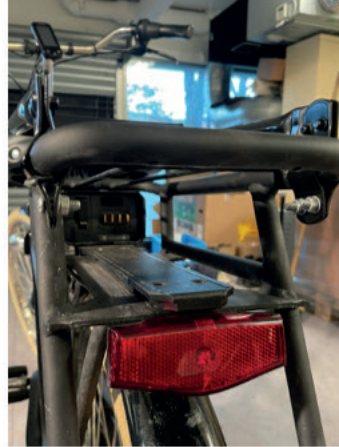
1.2 Remove the battery from the carrier.