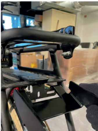
2.1 Place the Lockride with the two hooks behind the lighting bracket.