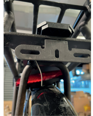
1.4 Remove the rear light and place it behind the stays to prevent the cable from damaging.